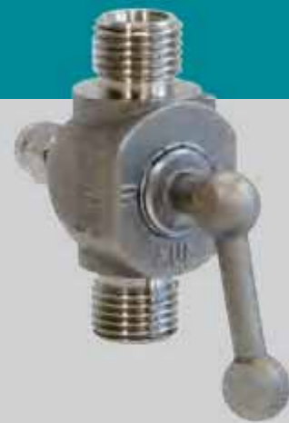
Typ VINTAGE fuel valve