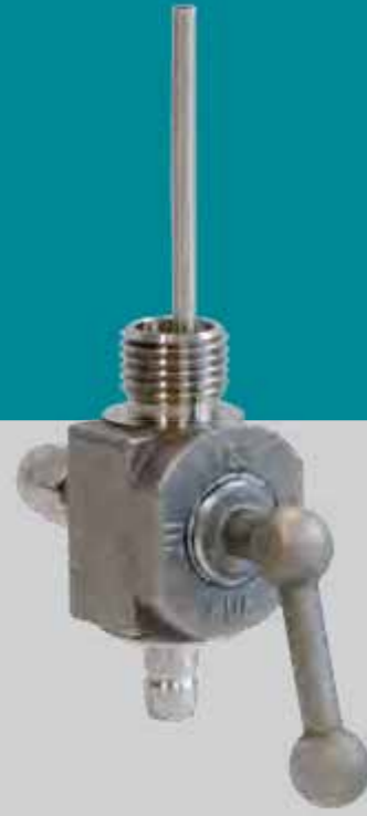
Typ VINTAGE oil cock with reserve option